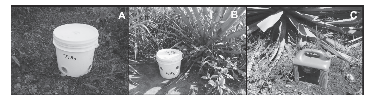
Fig. 1. Handmade designs of traps evaluated for capturing agave weevil on "maguey espadín" in Guerrero, Mexico. (A) TOCCI trap, (B) TOCCIA trap, and (C) container trap. In the 2nd experiment, TOCCIA traps were buried in the soil to the level of the holes.

In the 1st experiment, we evaluated 3 types of traps to capture the agave weevil: 1) TOCCI trap (Fig. 1A) at ground level (as recommended